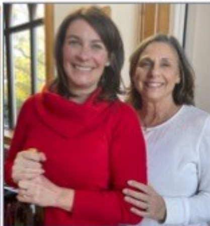
Cranberry mimosa's and decorating the Crismon Tree that day as well.