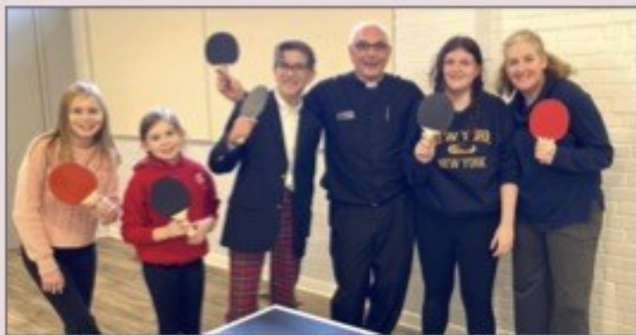
Ping Pong anyone?