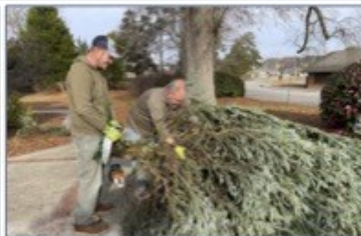
Arrival of our 14' Crismon Tree