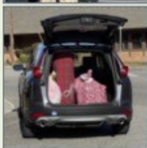
Special Delivery by Mr and Mrs. Clause to the children of Carriage Court Apt.