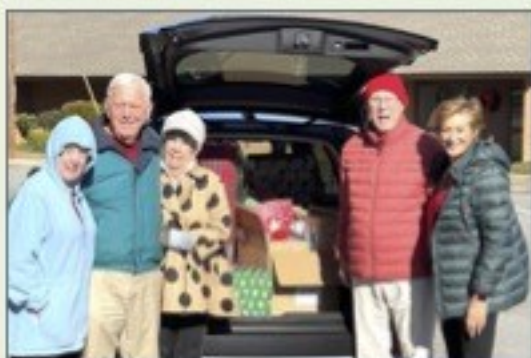
Thank you to all of you that participated this year.