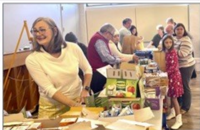
And if that were not enough, we also packaged 120 backpack food bags and 99 food pantry bags. Our Warm Up Guild also knitted 60 toboggans for the children at Winstead Elementary.