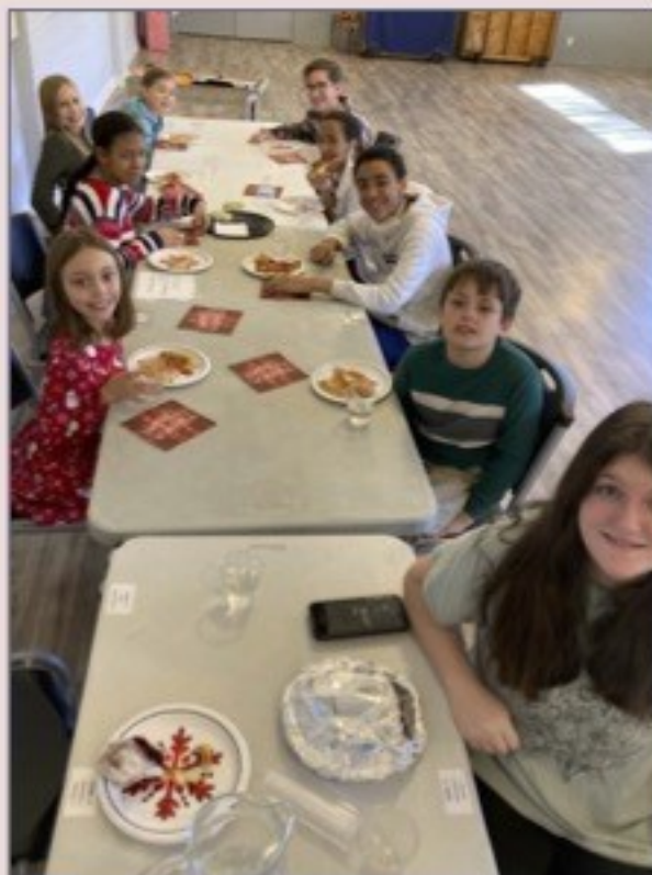
Lunch is served!