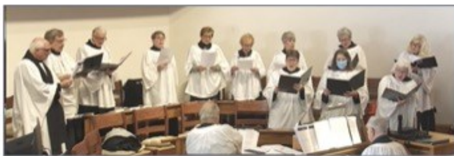
Lessons and Carols Sunday, December 18, 2022