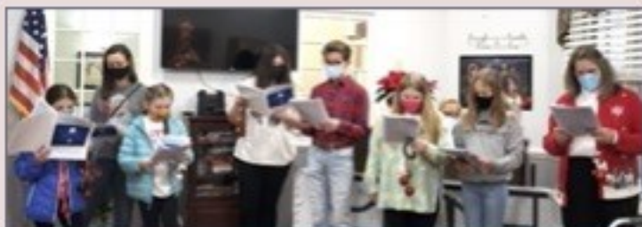
Some of our EYC singing carols to the residents of Spring Arbor Nursing Home.