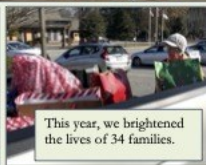
This year, we brightened the lives of 34 families.