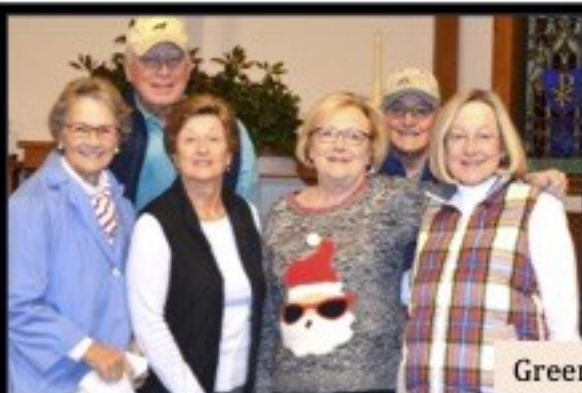
Greening of the Church