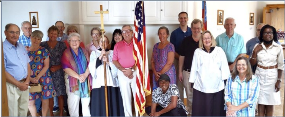
Some of the faithful present on Sunday, July 3