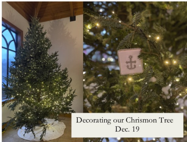
Decorating our Chrismon Tree Dec. 19

The women of our Warm-Up Guild gave 58 knitted hats to the children of our Back Pack food program at Winstead Elementary.