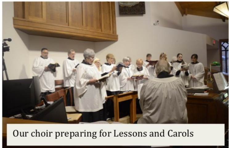
Our choir preparing for Lessons and Carols