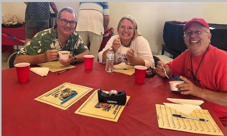
Annual Parish Picnic