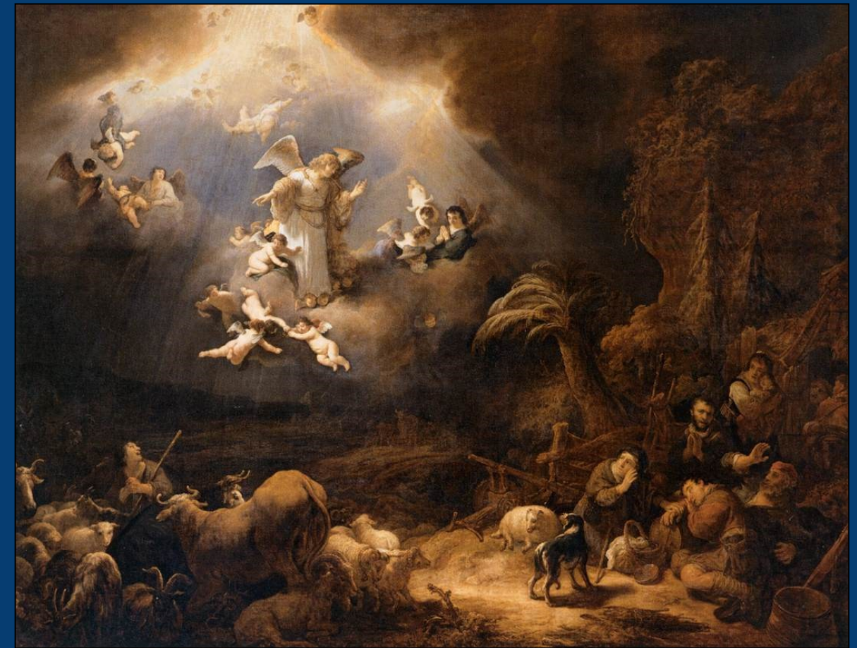
Govert Flinck Angels Announcing the Birth of Christ to the Shepherds 1639

All are welcome to come forward for a priestly blessing.