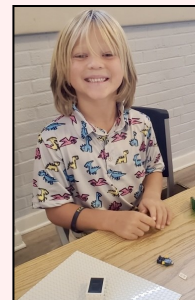
Story of Cain and Able in Legos

"Children are the seeds of our future. Plant love in their hearts and water them with wisdom and life's lessons."