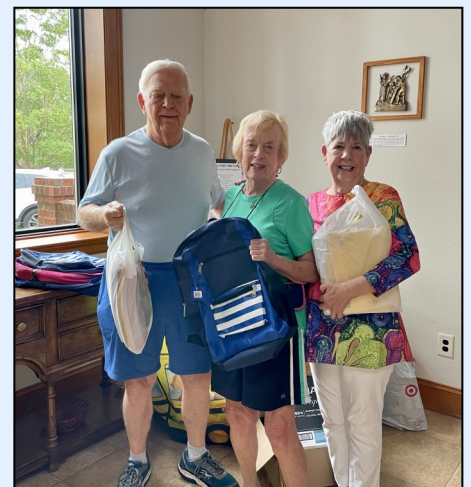
Thank you to everyone who brought supplies in!