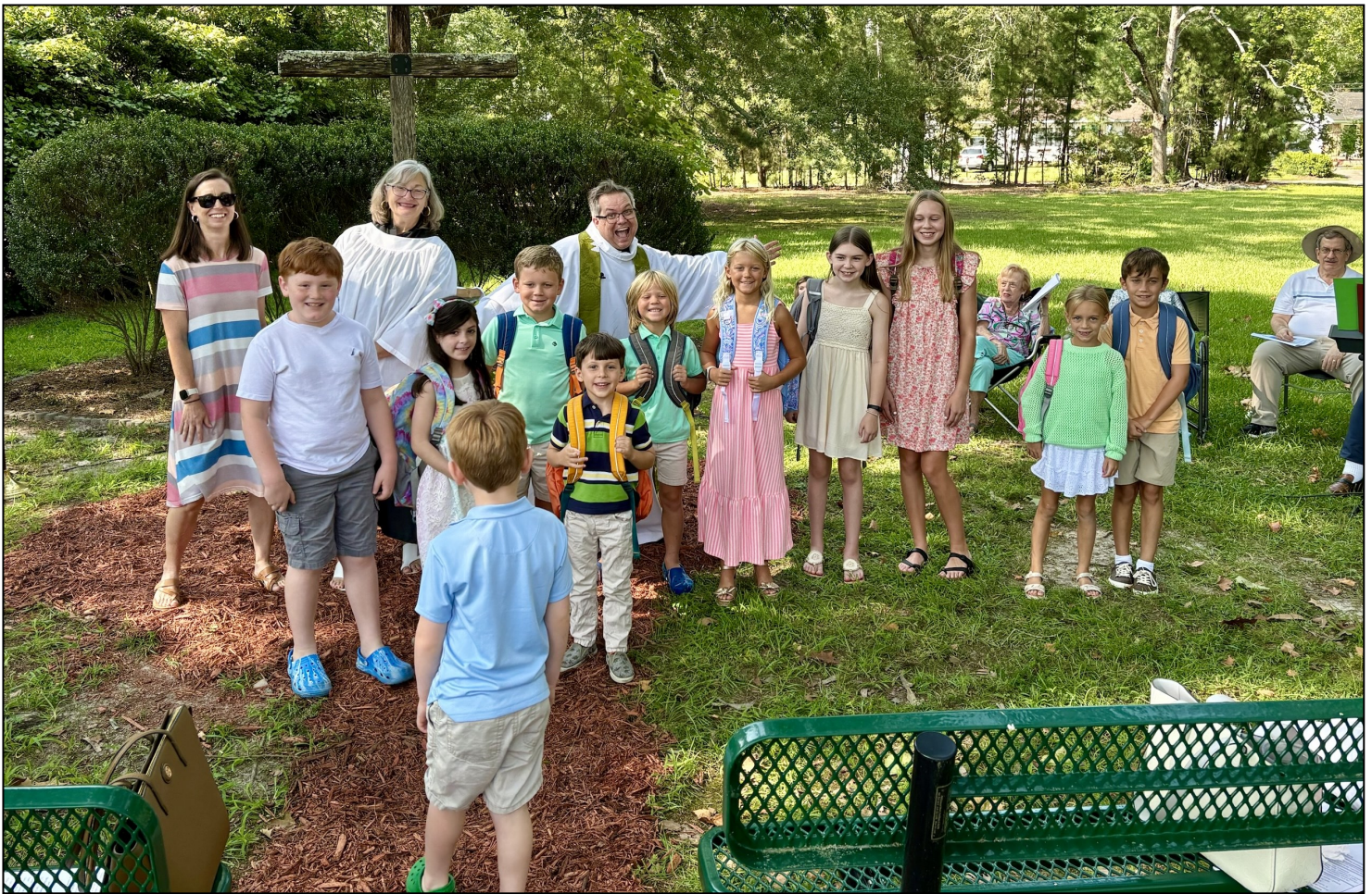
Outdoor Service Blessing of the Backpacks Plus a delicious BBQ lunch put on by our Men's Club!