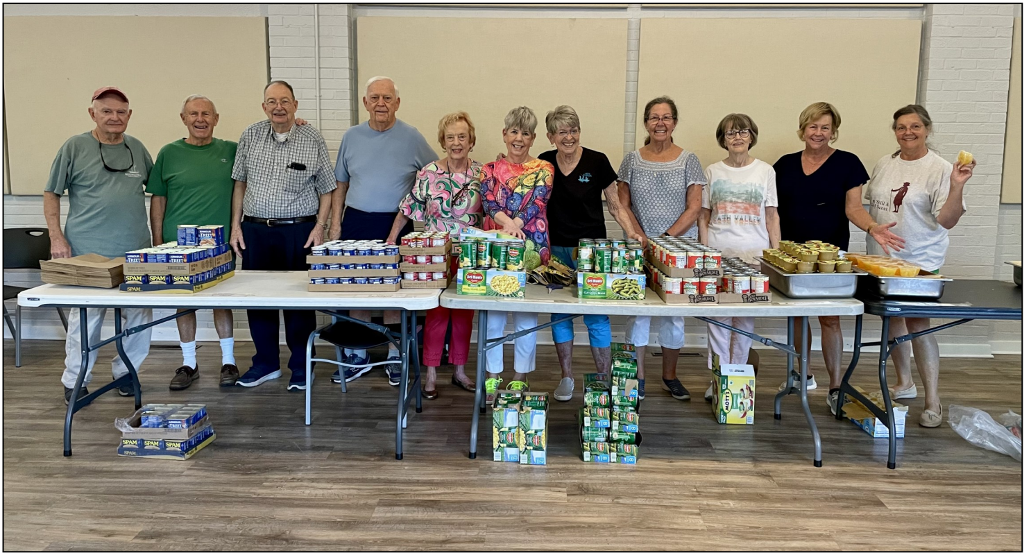
Thank you to everyone who came to help set up for Food Pantry!