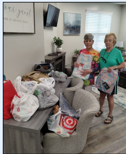
School supplies have been dropped off at Carriage Court.