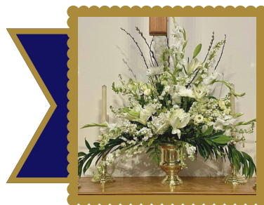
The altar flowers are given to the Glory of God by St. Andrew's